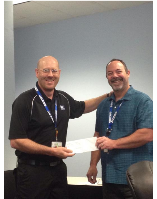
** Rewarding contract employee with award for exceptional work quality